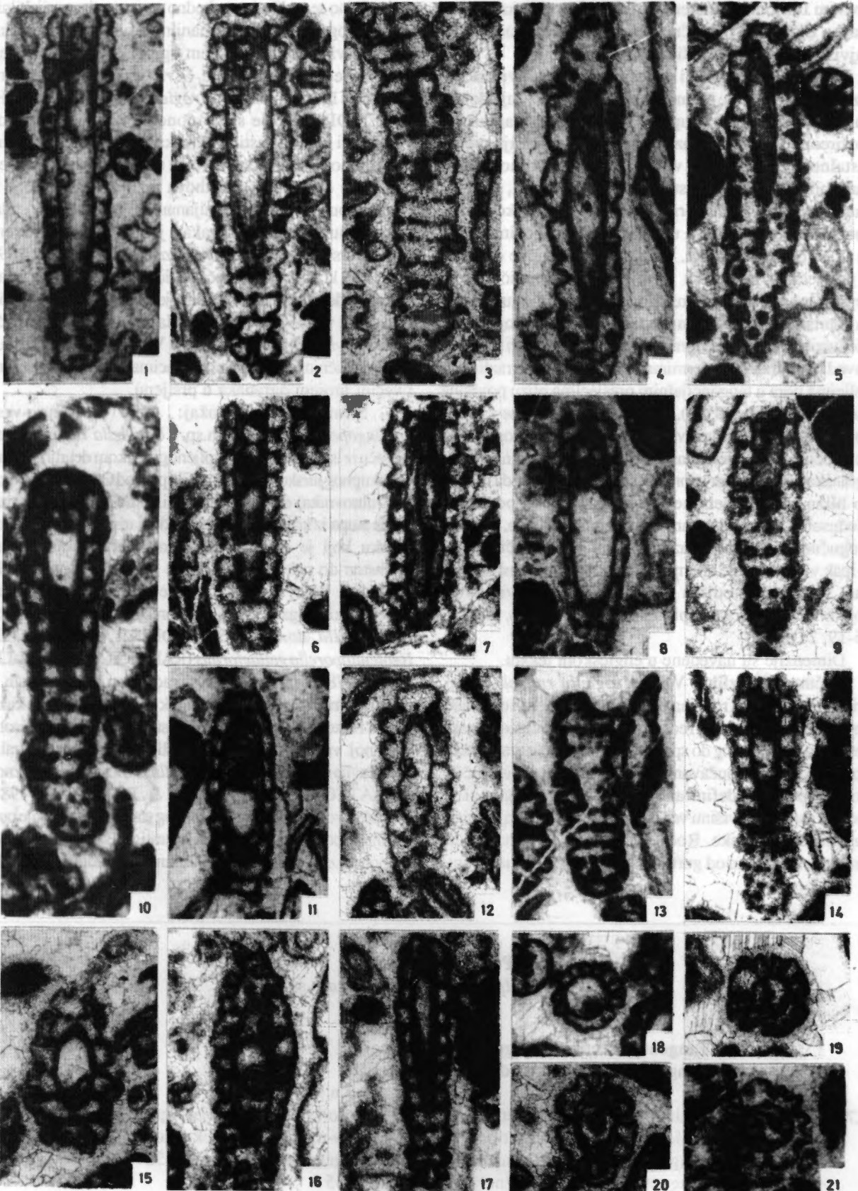
12-14.18.19. Diferencijalni prikazi (površni i bočni) spora... 15. Transverzalni prikaz spore... 16. Transverzalni prikaz spore... 17. Transverzalni prikaz spore... 18. Transverzalni prikaz spore... 19. Transverzalni prikaz spore... 20. Transverzalni prikaz spore... 21. Transverzalni prikaz spore...