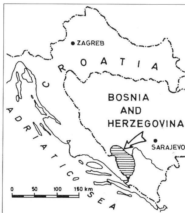
Fig. 1. Location map.

The first explorations were associated with problems concerning the outflow from karst poljes through ponors (sinkholes) and zones of ponors (SREBREN-OVIĆ, 1965; MIKULIĆ & TRUMIĆ, 1969; RISTIĆ, 1975). JOSIPOVIĆ (1974) wrote about the hydrodynamic conditions of the karst medium. Karst areal subdivision was studied by JOSIPOVIĆ (1974), KOMATI-NA (1975) and SLIŠKOVIĆ (1983) on the basis of geotectonic conditions in the Dinarides, while Šarin's stud-