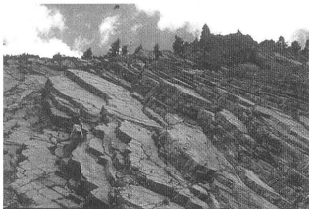
Fig. 2 Kozja Dnina, the type-locality of Valvasoria carniolica n.gen. n.sp.

allel transverse and oblique lines are seen under electron microscopy. In some places, two pores unequal in size appear closely together (Pl. I, Figs. 2, 3). The internal surface of the cuticle shows a relief structure, which can be observed in traces (partly shown on Pl. I, Fig. 4). In the middle part of the preserved holotype body annulation can be observed. It is represented by five circular belts approximately 0.1 mm wide. Distances between belts are 0.5 mm and 1 mm. The belts are composed of longitudinally arranged alternating fine ridges and grooves.