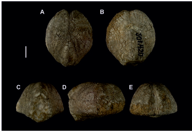
Figure 4. Echinocardium nummuliticum PÉRON & GAUTHIER (1885) holotype, MNHN.F.J01420. Photography Peter Massicard, program RECOLNAT (ARN-11-IN-B5-0004). A) Aboral view. B) Oral view. C) Posterior view. D) Side view. E) Anterior view (scale: 0.5 cm).

vestigations which yielded a rich echinoid fauna in the southern border of the Ouarsenis range have been carried out at the Kef Ighoud section, located 50 km to the ENE of our study area. Kef Ighoud echinoid-rich deposits have been attributed to the Eocene (POMEL, 1885), the Oligocene (DALLONI, 1936; MATTAUER, 1958) and finally to the lower to middle Miocene on the basis of their planktonic foraminifera (DERKAOUI, 2017).