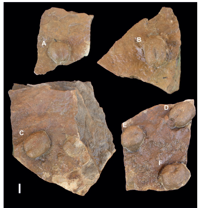
Figure 3. Cardioichnus planus from the lower Miocene of the Sidi Ali Mellal section. A) CAR-SAM-043. B) CAR-SAM-044. C) CAR-SAM-063. D) CAR-SAM-055. E) CAR-SAM-056. F) CAR-SAM-057 (scale: 1 cm).

The selected samples have been attributed to Cardioichnus planus due to their dimensions ( l = 20\text{--}37 mm; w = 16\text{--}26 mm), and the length/width ratio which are similar to that described by SMITH & CRIMES (1983) and BRUSTUR (2005). The ovoid to